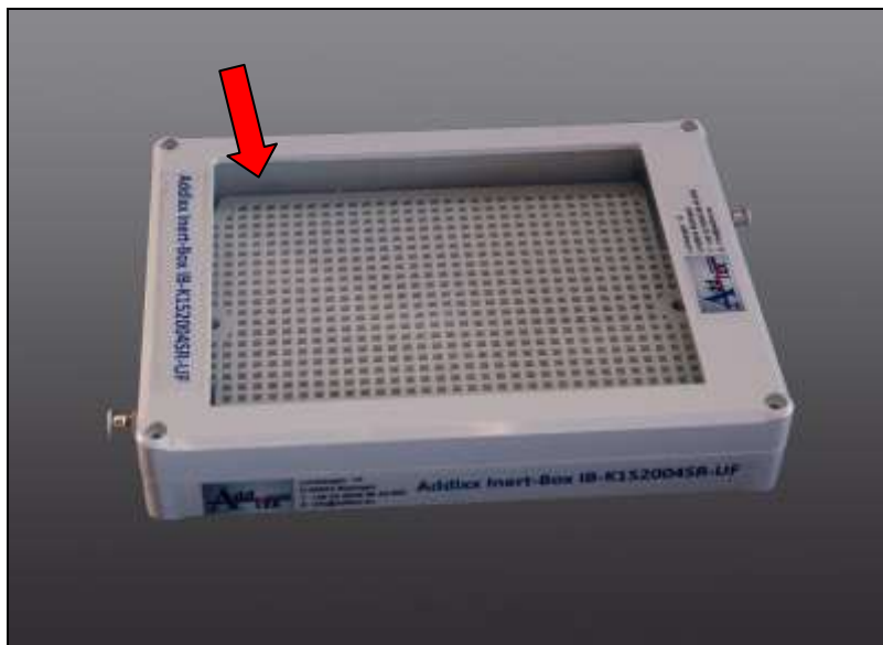
IB-K152004SR-UF Window for irradiating