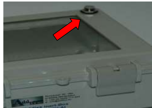
IB-K152010SV Gas outlet