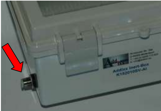
IB-K152010SV Gas inlet