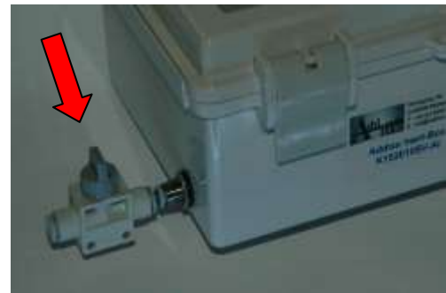
IB-K102010SV Gas inlet valve