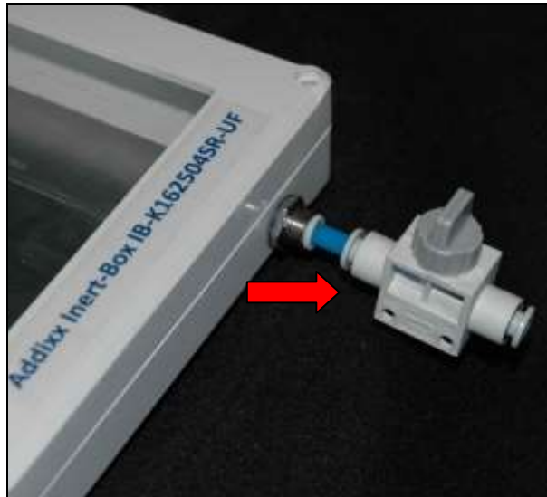
IB-K162504SR-UF Gas inlet / Gas outlet with valve