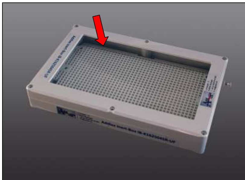
IB-K162504SR-UF Window for irradiating